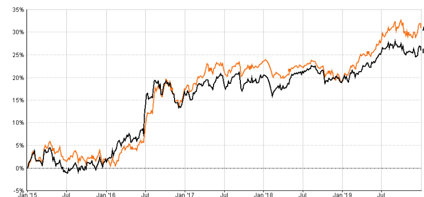
■ A - IB CINC - IronBright Cautious Income Core-Satellite 01/11/2019 TR in GB [30.89%] ■ B - Risk Rated Benchmark 20 TR in GB [26.00%]